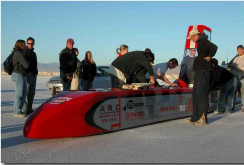
Above: The team preps the recording-breaking Bullet early on Friday morning.

"This condition can actually be easily rectified, and the team is working with the inverter supplier, Saminco, to change some inverter parameters to avoid low-voltage motor cut-off in the next run," said Rizzoni, "The record had to be certified over the third mile, as this was the fast qualifying mile. As you can see from the numbers listed below, the average of the two runs, roughly 250.5 mph, is less than one mph shy of the existing 251 mph record."